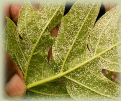
Papaya Whitefly on Papaya leaf